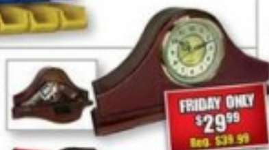
MANTLE GUN CLOCK #19461