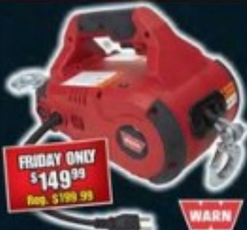
1000-LB. WARN® PULLZALL 120 VOLT AC WINCH/HOIST TOOL #147026

WARN® and the WARN logo are registered trademarks and/or service marks of Warn Industries, Inc.