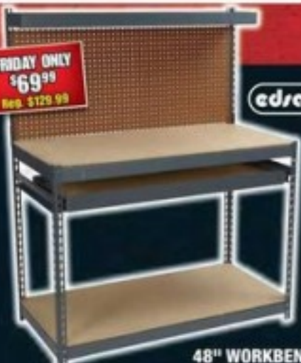
48" WORKBENCH #24340