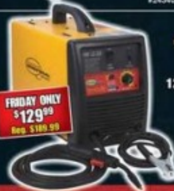
FLUX CORE 125, 115 VOLT WIRE-FEED WELDER #628575